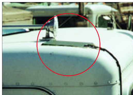
(Top) One of 500 concrete trucks used by LMC. (Bottom) The solar panel of a 5-Watt Solargizer Solar Charger mounted on the roof of the cab.

RESULTS: All the batteries in stock improved dramatically after they were charged, and/or conditioned by the PulseTech products. When the older batteries were taken off the PRS units, they tested even better than new batteries! The new batteries coming off the shelves after being maintained by the RediPulse 6-12 system also gave better readings than before. The batteries on the trucks tested better, as well, after using the PowerPulse and 5-Watt units. In all, not only was battery life extended, but labor, truck downtime, alternator wear and starter replacement costs were less. Plus, the percentage of bad batteries in the warranty period went from 28% to zero!