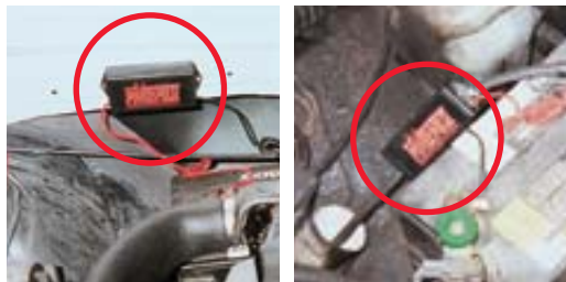
(Top) A 1970 Oldsmobile 442 and a 1976 Chevy Blazer (middle) with 12-Volt PowerPulse Battery Maintenance Systems installed (bottom left and right). Both batteries are at least seven years old and still going strong.

that the battery was dead. That doesn't happen anymore though. Now my cars start every time I need them and the batteries are stronger than ever. No matter how many cars I collect, I'll make sure they each have a PulseTech unit installed."